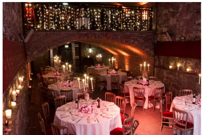
Image: McEwan Hall (left) and The Caves (right).

“The 23rd EAPR Triennial Conference will be held in Edinburgh, Scotland on 6th—10th June 2027”