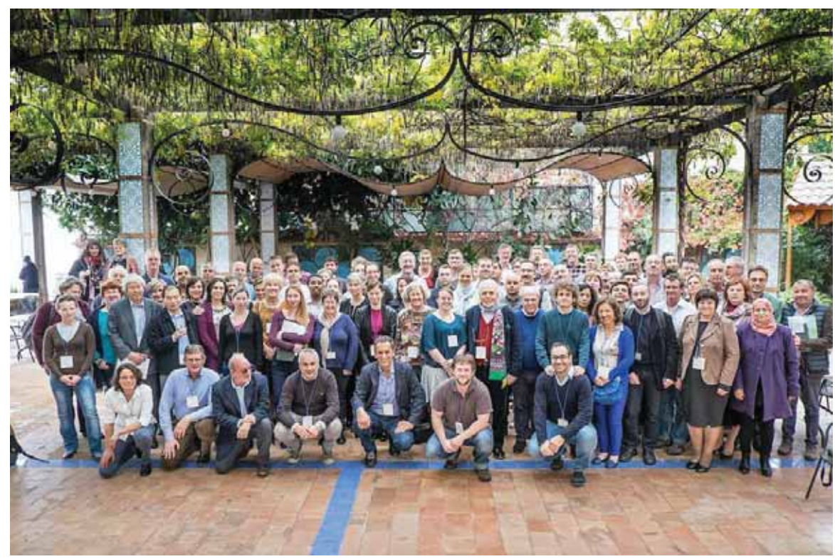
Participants of 18th joint meeting EAPR Breeding and Varietal Assessment Section and EUCARPIA Section Potatoes, Vico Equense, Italy 15-18th November 2015