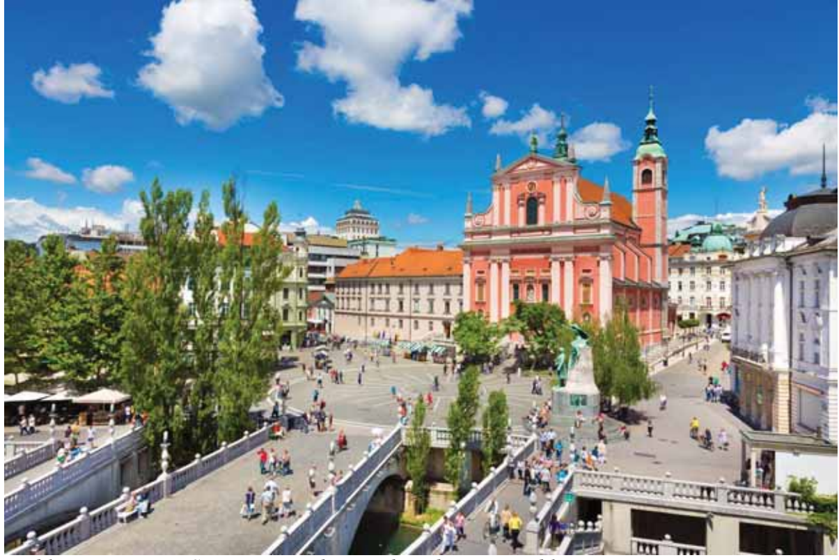
Ljubljana, Preseren Square