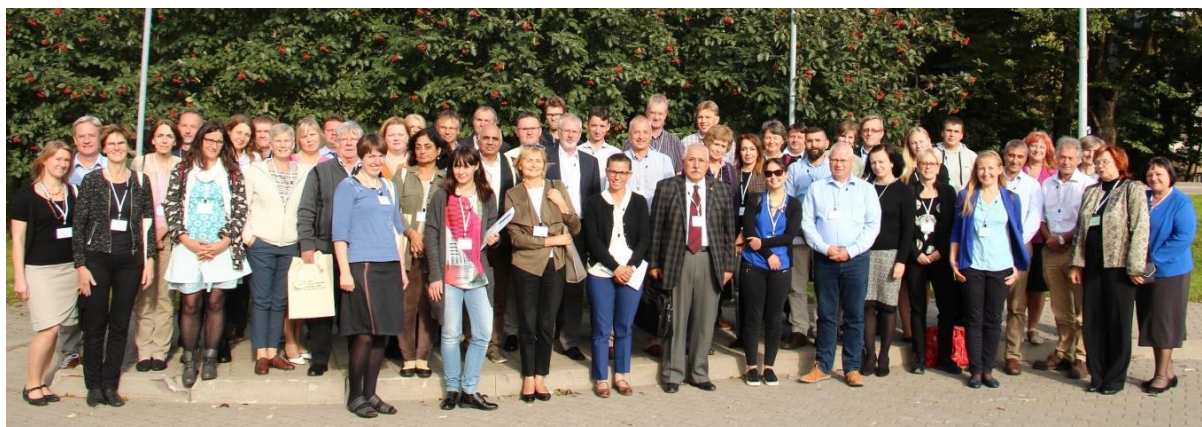
Participants of the EAPR Agronomy and Physiology Section Meeting in Riga, 26-29th September 2016