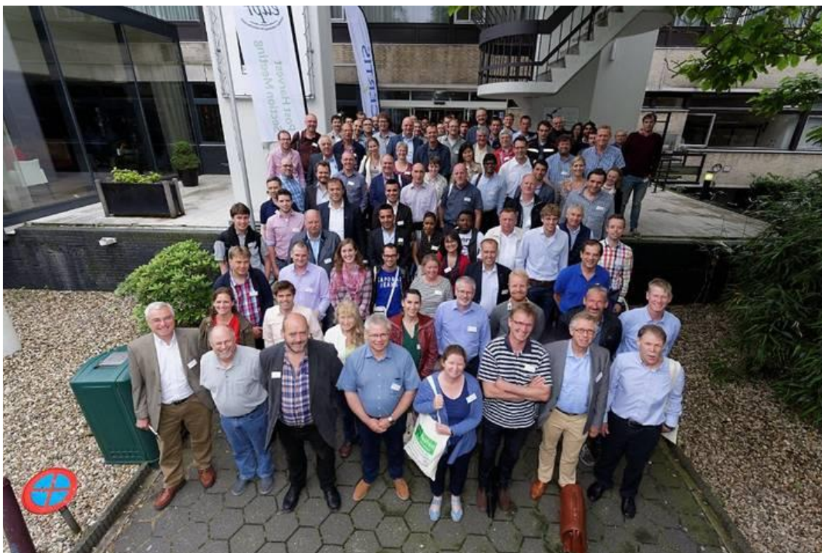
Participants at EAPR Post Harvest Section Meeting 2016