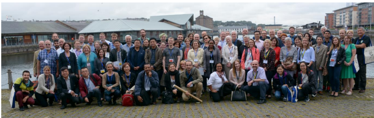
Participants of the EAPR Pathology and Pests Section Meeting in Dundee, 7th-11th August 2016